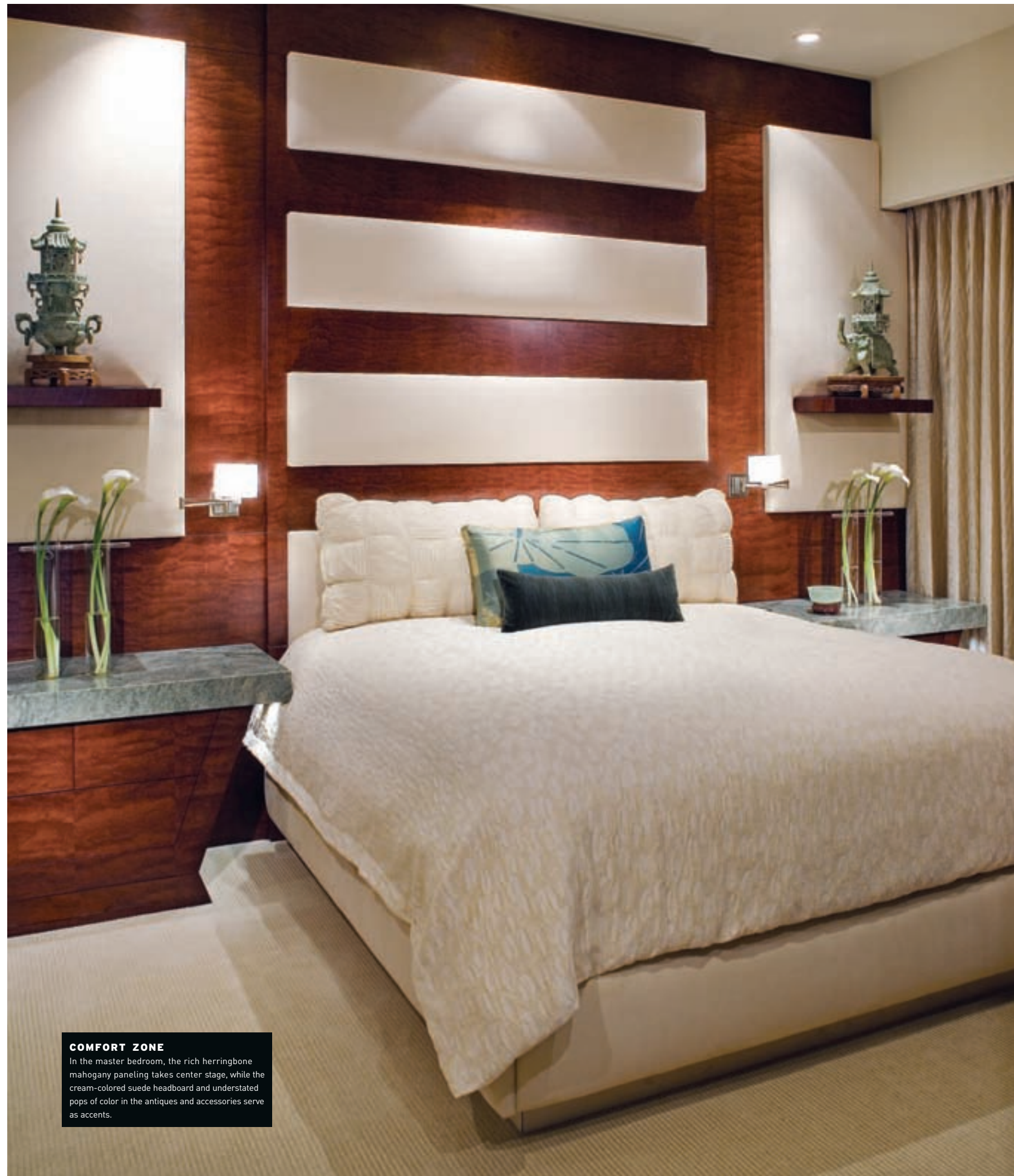
COMFORT ZONE In the master bedroom, the rich herringbone mahogany paneling takes center stage, while the cream-colored suede headboard and understated pops of color in the antiques and accessories serve as accents.