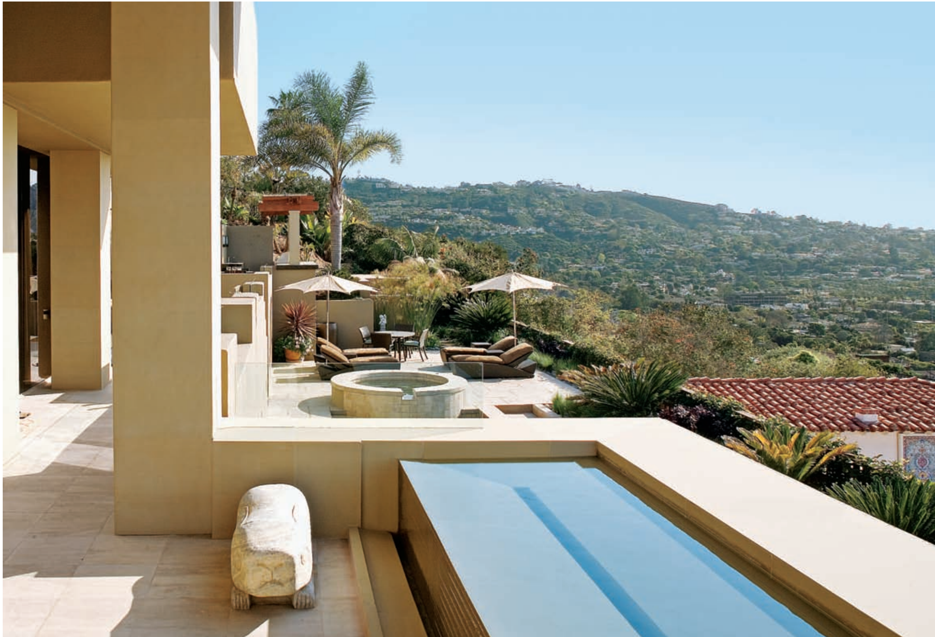
POINT OF VIEW From the hillside location of the back patio, the owners enjoy breathtaking views of the Pacific Ocean. The water feature was designed by architect Siavash Khajezadeh.